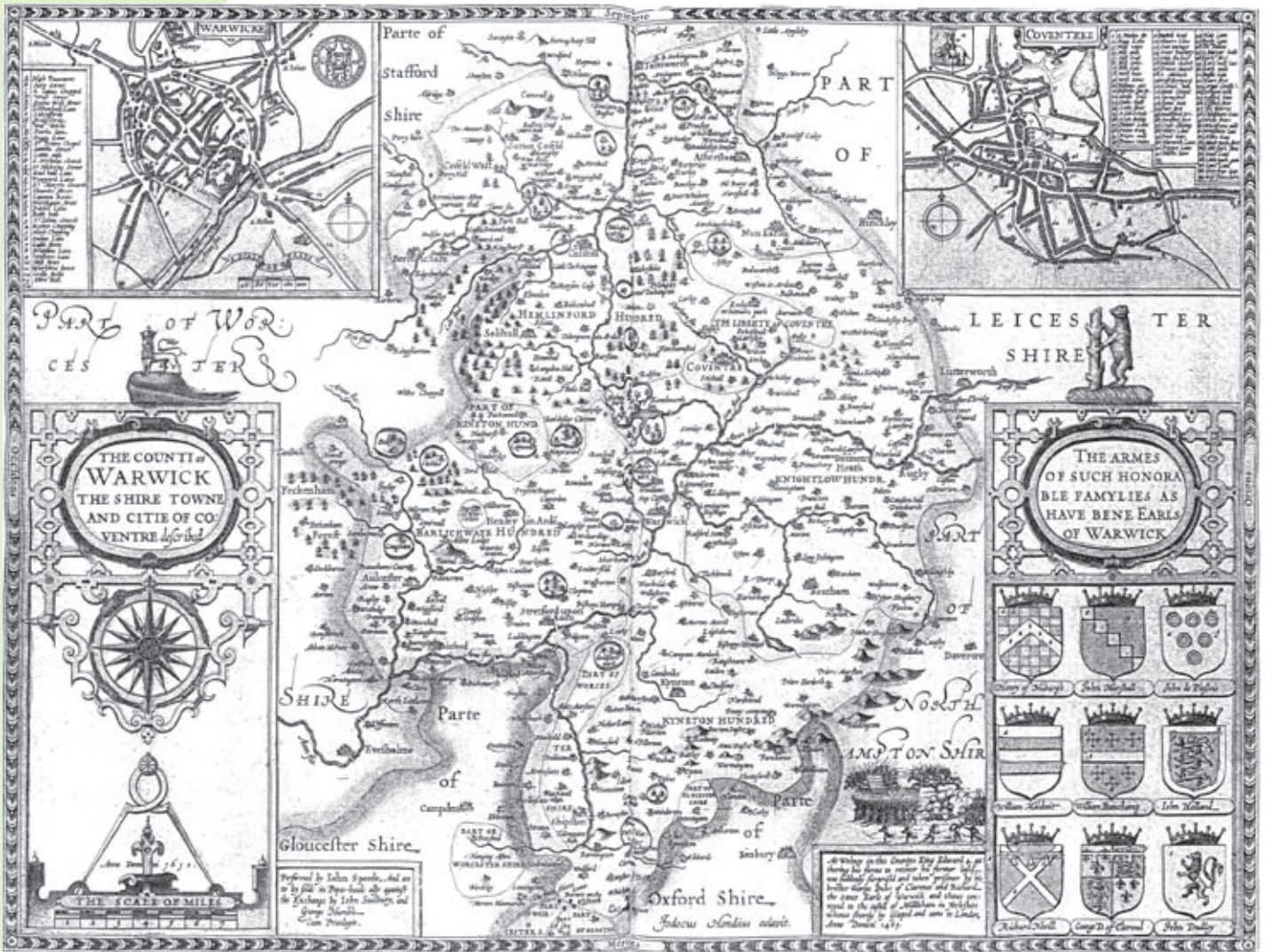
John Speed's map of Warwickshire